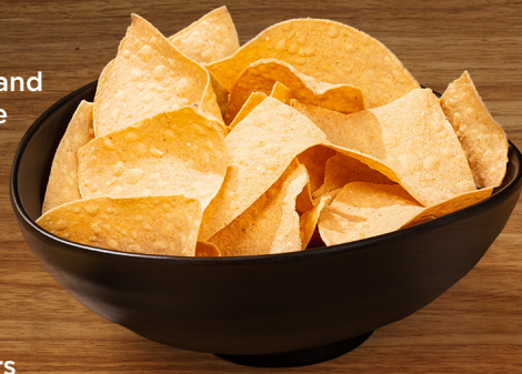
Chips and Cheese