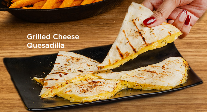
Grilled Cheese Quesadilla