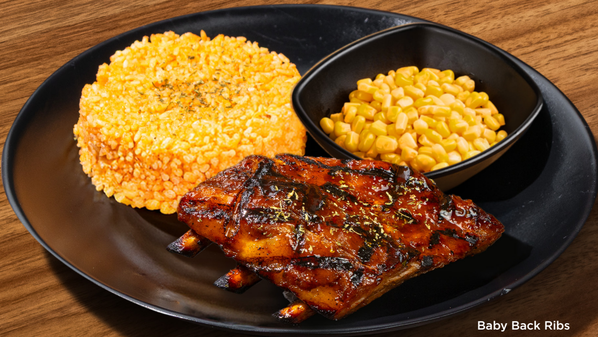
Baby Back Ribs