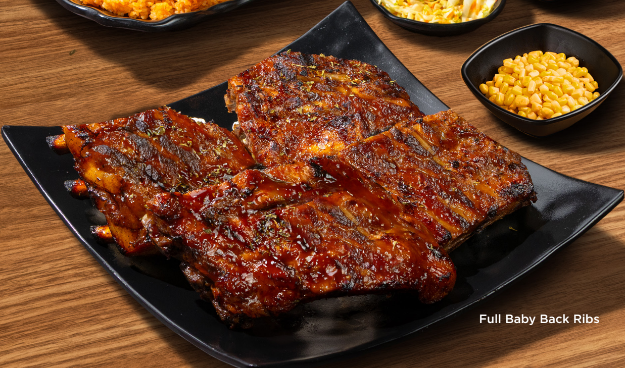
Full Baby Back Ribs